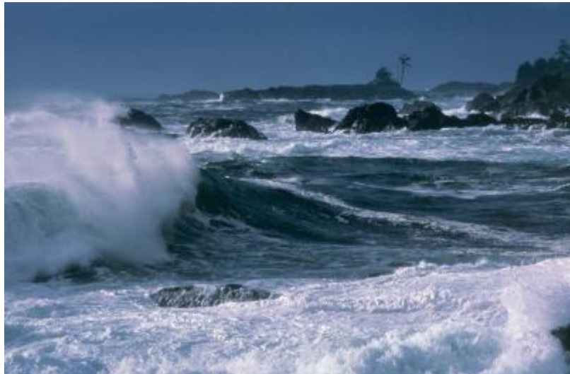
District Of Ucluelet - Click Photo To Enlarge

Ultimately it's that intimate sense of caring residents express for their community that permeates a visit to Ucluelet. It's reflected in their relationship to the outdoors and wildlife; the numbers, types and style of businesses offered, in the recognition that they indeed have a special place and a determination to not spoil that gift.