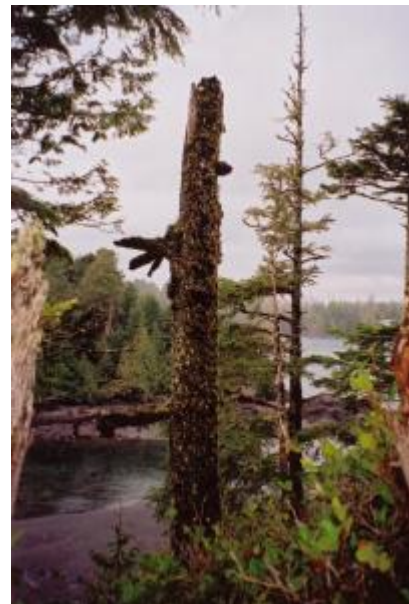
District Of Ucluelet - Click Photo To Enlarge

Few communities are so well poised to comfortably view and experience some of the wildest storms in Mother Nature's arsenal than Ucluelet. The village of 1,800 is surrounded by verdant forest, islands and vast stretches of pebbly shore. And there are plenty of cozy places where you can snuggle up, drink a cup of tea (or a glass of wine) in front of a roaring fire, and watch the winter waves pound the surf and the rain lash the windows.