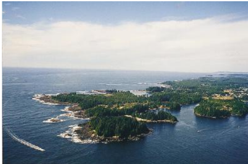
District Of Ucluelet - A Skip Rowlan Photo - Click Photo To Enlarge

By mid-March, the storms abate in time for the procession of an estimated 19,000 migrating gray whales from Baja California on their way to the summer feeding grounds of the northern Pacific. While the migration starts in March, resident whales are in the area until late in the fall.