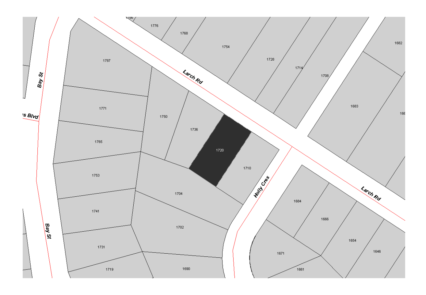
SCHEDULE 'A" Bylaw 1167