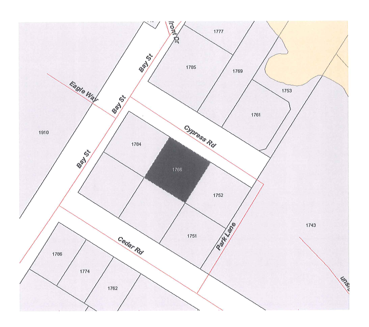
SCHEDULE 'A" Lands affected by Zoning Amendment Bylaw No. 1161, 2013