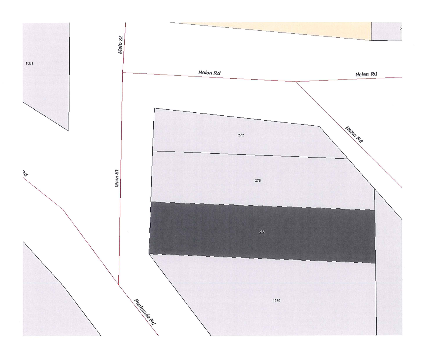
SCHEDULE 'A" Bylaw 1158